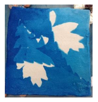
Oak and Beech leaf

The tiles will have prints on from plant materials and leaves taken from around the pond and on the beach. They will look like this. The tiles will hopefully look good as a tiled wall above the cabinets. They can however also be used as an educational tool for identification of plants and for explaining the cyanotype printing process. Of course there is the natural historic reference to the botanist/ photographer Anna Atkins. In short, a historical educational narrative with the