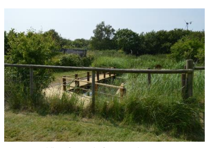
View from platform to pigsty

Just the sheer people power and expertise one would need to make this come off the ground is enormous. An architect, a water engineer, a wildlife expert, an environmental scientist, graphic designers, people experienced in this area regarding the sewage treatment and the wildlife, a handful of skilled hard working builders, cooks, clearers, cleaners and buckets of enthusiasm. In short a project like this needs the unique mix of people who visit Othona regularly plus all their friends, family and acquaintances. Pigs can fly! I decided to sit on the new platform for a while and ponder. An adder was sunbathing next to the platform, it's geometrical zigzag a lovely contrast with the bushy greens. The reeds were singing in the wind and warblers were making their territory crystal clear. A salty sea breeze and the hot sun topped the experience. This would indeed make a rich educational environment worth sharing with the next