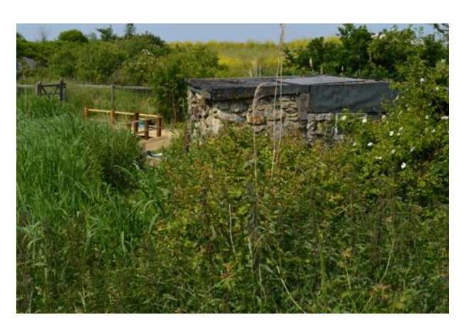
View of the pond area taken from the reed beds.

It so happened that I was visiting the Othona Community in July 2015 and that Tim Fox mentioned a plan to rejuvenate the area around the dipping platform, including turning the pigsty into a resource room to make it more usable for school groups. Some generous funding had been received from The Bradwell Wind Farm Community Fund. Always interested in Othona projects, I decided to have a look at the