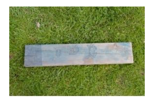
A cyanotype experiment on wood, using images on acetate of species occurring along the Essex coast.